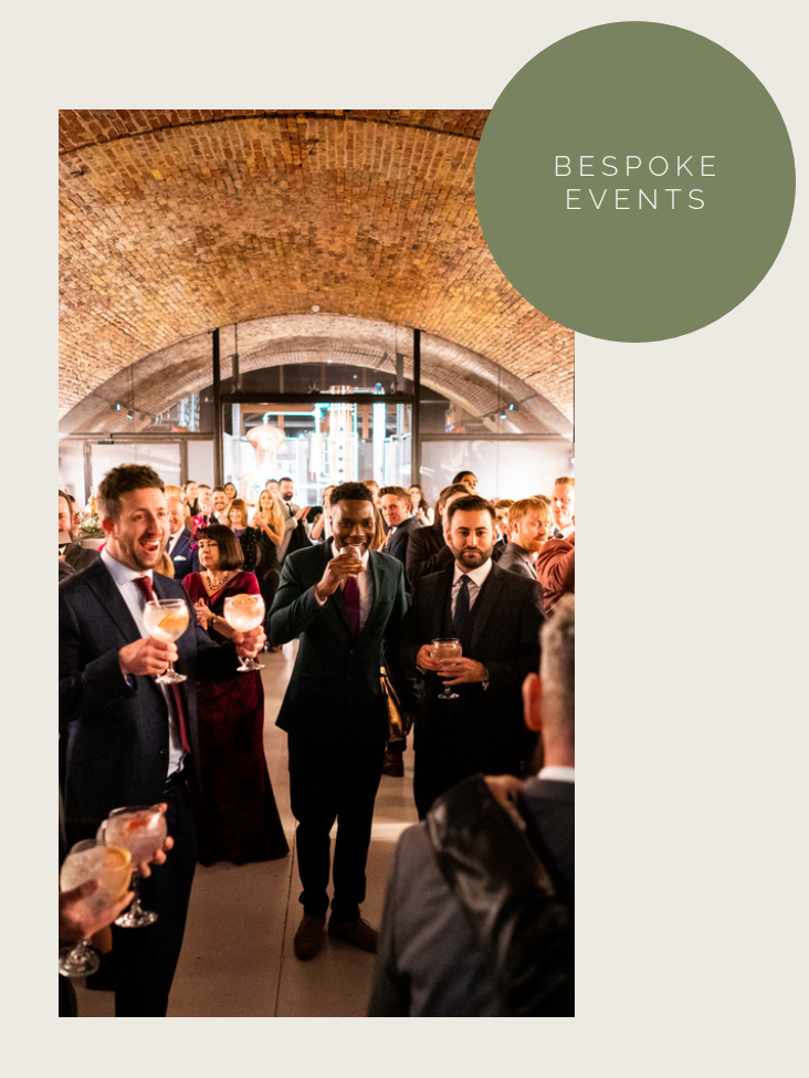
Private venue hire

10 - 65 people From £99 per person 2 - 3 hours