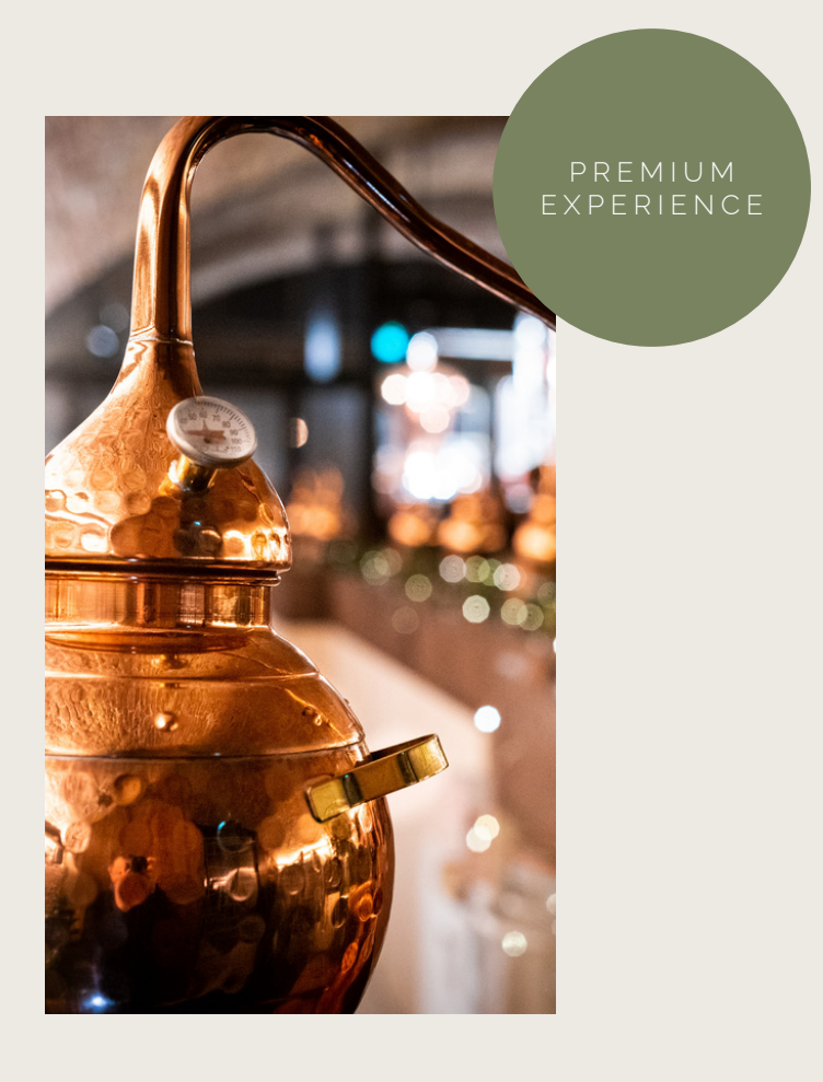
Gin making school

10 -50 people From £49 per person 1.5 - 2 hours