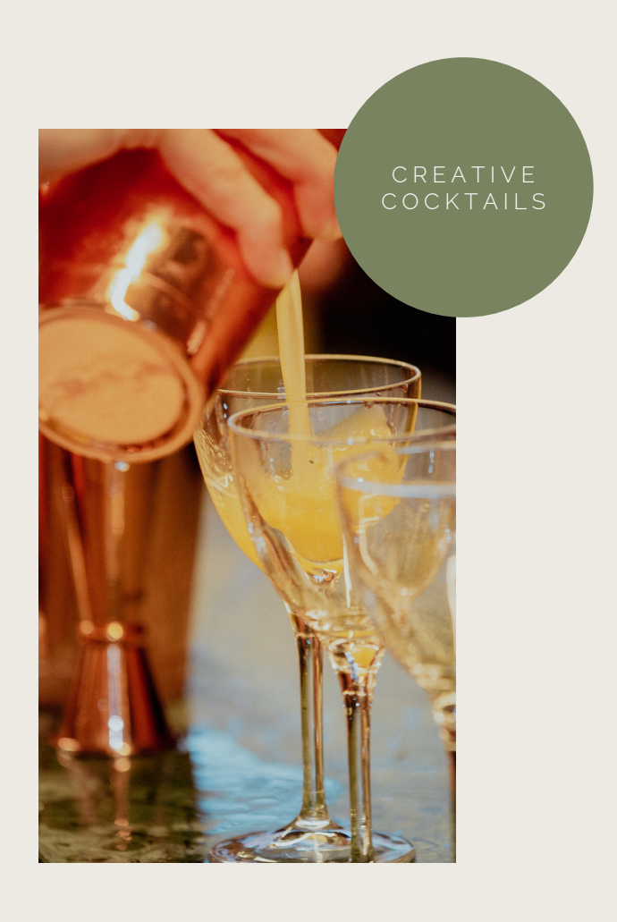
Cocktail making masterclass

10 - 80 people From £29 per person ı hour